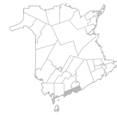
Community Saint John, Simonds and Musquash