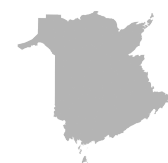
Province New Brunswick