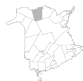
Community Campbellton, Atholville, Tide Restigouche Area Head Area