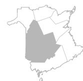
Zone 3 Fredericton and River Valley Area