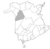
Community Perth-Andover, Plaster Rock, Tobique Area