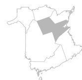
Zone 7 Miramichi Area