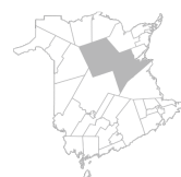
Community Miramichi, Rogersville, Blackville Area