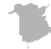
Province New Brunswick