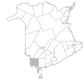
Community St. Stephen, Saint Andrews, Campobello Island Area