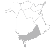
Zone 2 Fundy Shore and Saint John Area