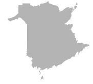
Province New Brunswick