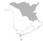
School district Anglophone North