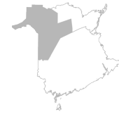
School district Francophone Nord-Ouest