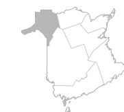
Zone 4 Madawaska and North-West Area