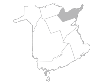
Zone 6 Bathurst and Acadian Peninsula Area