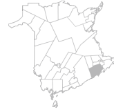
Community Hillsborough, Riverside-Albert, Alma Area