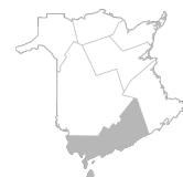
Zone 2 Fundy Shore and Saint John Area