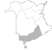
Zone 2 Fundy Shore and Saint John Area