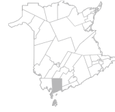
Community St. George, Grand Manan, Blacks Harbour Area