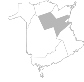
Zone 7 Miramichi Area