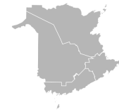
Education sector Anglophone