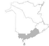
School district Anglophone South