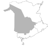
School district Anglophone West