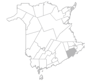
Community Hillsborough, Riverside-Albert, Alma Area