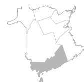
Zone 2 Fundy Shore and Saint John Area