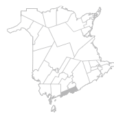
Community Saint John, Simonds and Musquash