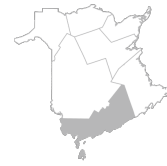
Zone 2 Fundy Shore and Saint John Area