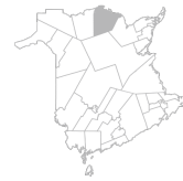
Community Dalhousie, Balmoral, Belledune Area