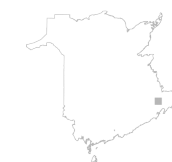
Hospital Dr. Georges-L.- Dumont University Hospital Centre