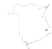
Hospital The Moncton Hospital