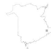
Hospital Dr. Georges-L.- Dumont University Hospital Centre