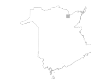
Hospital Chaleur Regional Hospital