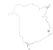
Hospital Dr. Georges-L.- Dumont University Hospital Centre