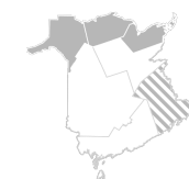
RHA Vitalité Health Network