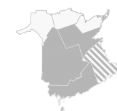
RHA Horizon Health Network