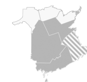
RHA Horizon Health Network