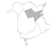
Zone 7 Miramichi Area