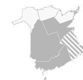
RHA Horizon Health Network