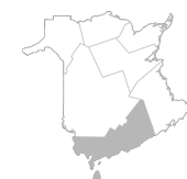
Zone 2 Fundy Shore and Saint John Area