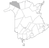
Community Kedgwick, Saint-Quentin and Grimmer