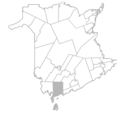
Community St. George, Grand Manan, Blacks Harbour Area