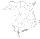
Community Saint John, Simonds and Musquash