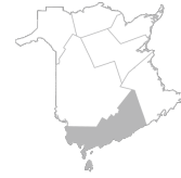
Zone 2 Fundy Shore and Saint John Area