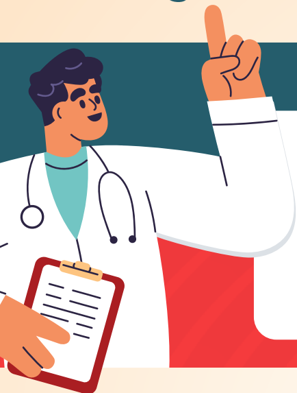
Percentage of individuals with a primary care provider